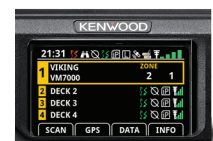
Night - High Contrast