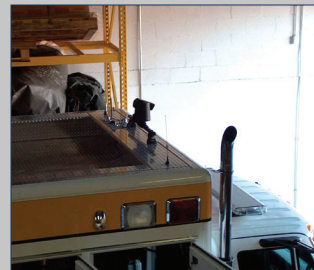
Cameras on top of vehicles