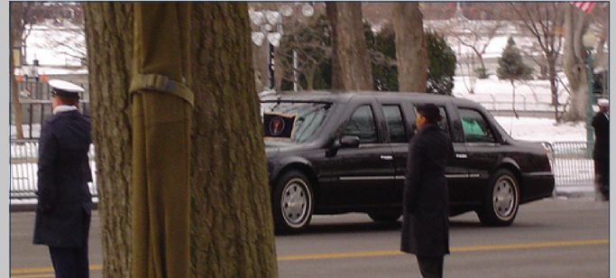
Presidential motorcade during the 2005 inauguration