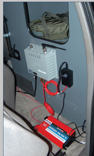
3eTI WLAN inside vehicles