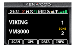
Night - High Contrast